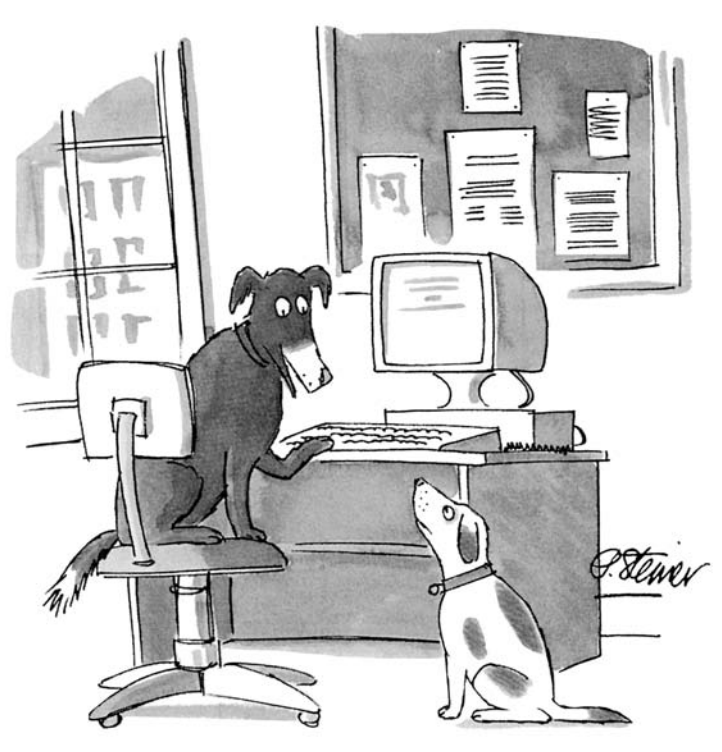
"On the Internet, nobody knows you're a dog."

Nonprofit organizations must bear in mind that the recent boom in online technology coincided with a robust economy (and even so, many institutions strained to cover the costs of installing and implementing the new technologies). In today's economic doldrums, institutions will need to be more strategic in their adoption of new technology and make sure that the expenditures are balanced among overall institutional needs. Identifying and connecting with engaged online communities can often accomplish more than sizable investments. Universities may find, for example, that they can achieve more in some areas by training students in new applications for their personal laptop computers than by building out new computer labs.